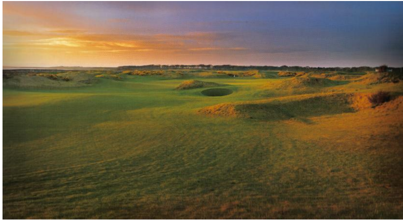
Kingsbarns Golf Club

Kingsbarns golf course in the am on the outskirts of the village of St. Andrews Golf course has fantastic views and a great course to finish the trip. Fairways are wide and generous but the greens are small and treacherous.