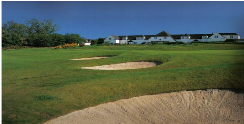
The Dukes Golf Club