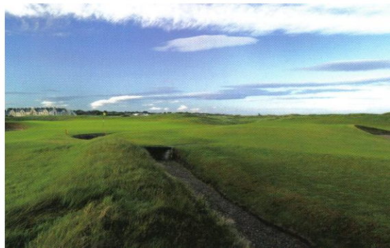
Carnoustie 3 rd Hole