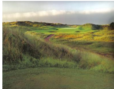
The Castle golf course