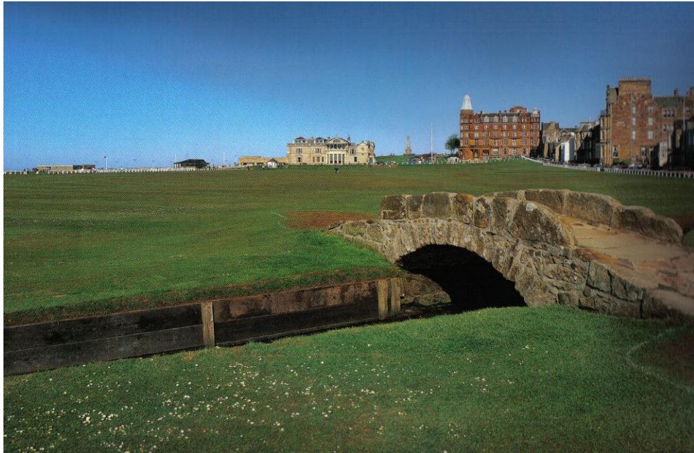
St. Andrews and the famous Swilcan Bridge

Day 6 The 18 th hole of St. Andrews and the famous Swilcan Bridge . Can you see yourself and your foursome getting your pictures taken here just like Jack, Arnie, Phil & Tiger ! A moment you will cherish the rest of your life! Play the world famous home of golf, St. Andrews Old Course . Designed by Old Tom Morris himself, we need not say more!!! Photographs on the first tee Swilcan Bridge of your 4 ball, individual picture and group. Lunch in the St. Andrews clubhouse . Caddie. Old Course play is guaranteed.