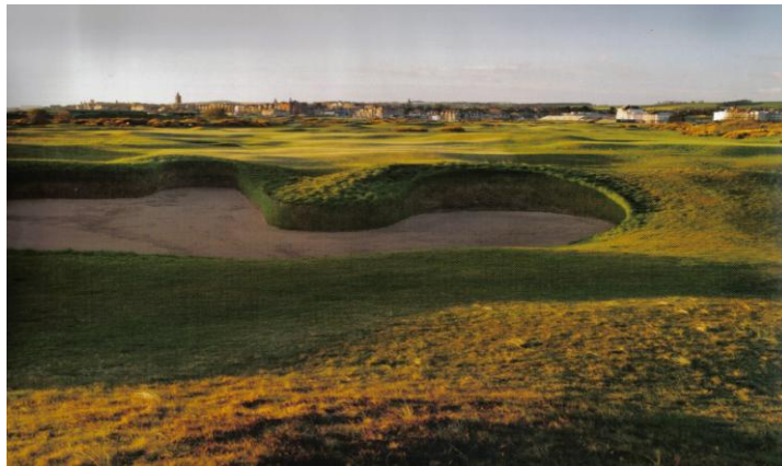
Danger / Do Not Enter

Day 6 The 18 th hole of St. Andrews and the famous Swilcan Bridge . Can you see yourself and your foursome getting your pictures taken here just like Jack, Arnie, Phil & Tiger ! A moment you will cherish the rest of your life! Play the world famous home of golf, St. Andrews Old Course . Designed by Old Tom Morris himself, we need not say more!!! Photographs on the first tee Swilcan Bridge of your 4 ball, individual picture and group. Lunch in the St. Andrews clubhouse . Caddie. Old Course play is guaranteed.