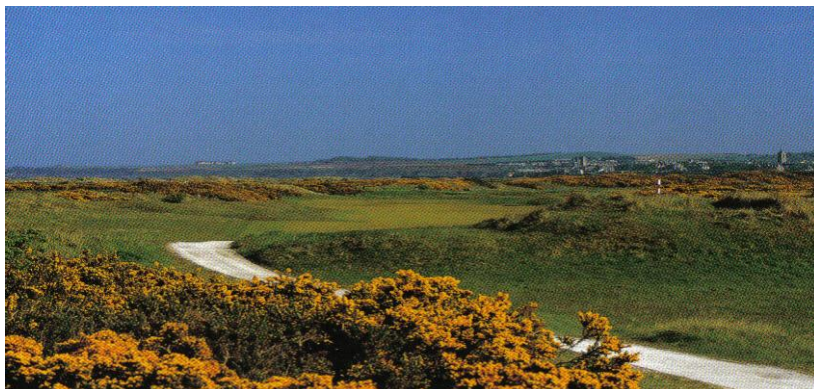
St Andrews New course opened in 1897