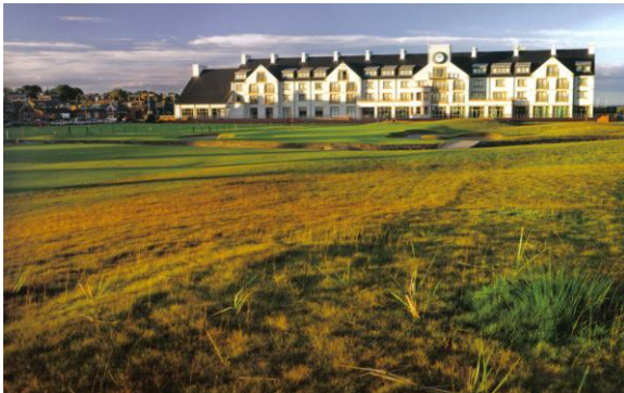
Carnoustie's 18 th / Barry Burn & Clubhouse