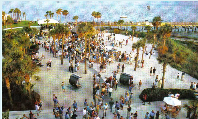
Charleston Marina Hotel Beach