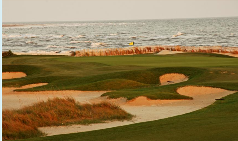
The Ocean Course Kiawah Island 18 th Hole, Home to USA victory in a Ryder Cup

Tuesday Play the famous Ocean Course home to 2007 Senior PGA Championship. Caddie included. Panoramic views of Atlantic Ocean. Home of the 1991 Ryder Cup.