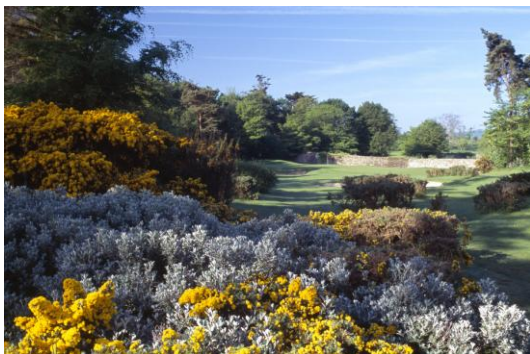
A par 3 on the Druids Heath