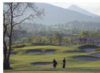
Druids Heath 18 th hole