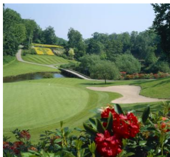
Druids Glen # 12

Day 1 Your arrival is in Dublin, Ireland around 8:30 am. You transfer via motor coach to the 5 Star Marriott Hotel/Spa and Golf Resort at Druids Glen. In the afternoon your play is at Druids Heath which is a parkland style course with colourful scenic views of the Wicklow Mountains and the Irish Sea. Welcome cocktail party and dinner. Option is to play Blainroe golf club on arrival day and play 36 holes on day two at Druids Glen. Lunch is included in this option.