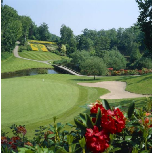
The Signature par 3/ 12 th hole