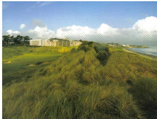
Portmarnock Links 18 th finishing hole

Day 6 Play the Island , another great test of Irish links golf. Cocktail party & dinner. Enjoy the nightlife of the great city of Dublin.