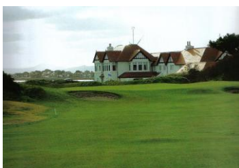
# 18 green & Clubhouse

Day 4 Your group will motor coach to the North of Dublin area for your stay at 4 Star Portmarnock Hotel & Golf Links Resort, built round the former home to the Jameson whiskey clan. Hotel options in city centre of Dublin are the Shelbourne Hotel or the 5* Westin. Enjoy the terrific nightlife of Dublin.