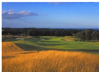
Druids Heath # 2

Day 2 This morning's round is played on the Druids Glen course also know as the " Augusta of Ireland ". The course has many unique features such as the beautiful fawn and flora along with bushes and hedges sculpted into serpents. Another facet is the discovery of the Druid statue protecting the 12 th green, not to mention the Island green at the 17 th hole. Druids beautiful rolling hills and elevation changes make this course one of the prettiest and challenging in the world. Druids Glen has hosted many Irish Opens in its history. After your round, you may want to take advantage of this opportunity to play an additional round at Druids Glen or then enjoy a golfer's massage and hot tub therapy in the relaxing spa.