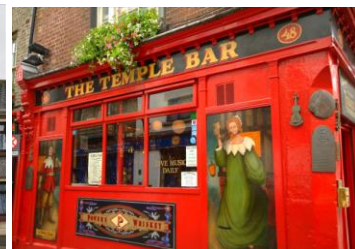
Temple Bar Pub

Your Dublin package starting from $3,995.00