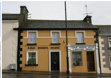
Quiet Man Pub