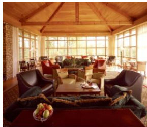
Druids Glen Lounge