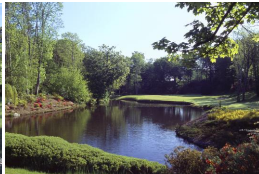
Druids Glen # 12