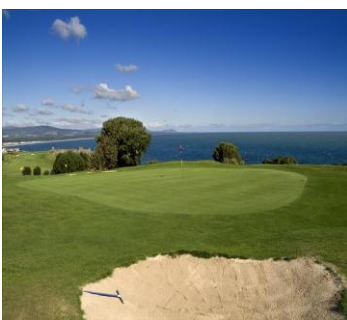
Blainroe Golf Club