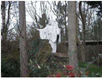
Statue of the "Druid"