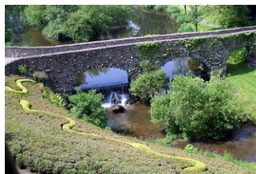
The "Ornamental Serpents"