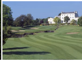
Druid 18 th hole & clubhouse