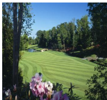
Druids Glen # 13

Day 2 This morning's round is played on the Druids Glen course also know as the " Augusta of Ireland ". The course has many unique features such as the beautiful fawn and flora along with bushes and hedges sculpted into serpents. Another facet is the discovery of the Druid statue protecting the 12 th green, not to mention the Island green at the 17 th hole. Druids beautiful rolling hills and elevation changes make this course one of the prettiest and challenging in the world. Druids Glen has hosted many Irish Opens in its history. After your round, you may want to take advantage of this opportunity to play an additional round at Druids Glen or then enjoy a golfer's massage and hot tub therapy in the relaxing spa.