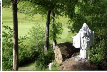
Druid protecting the 12 th green