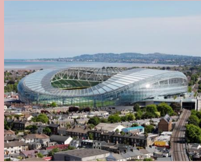
September 1, 2012 Aviva Stadium