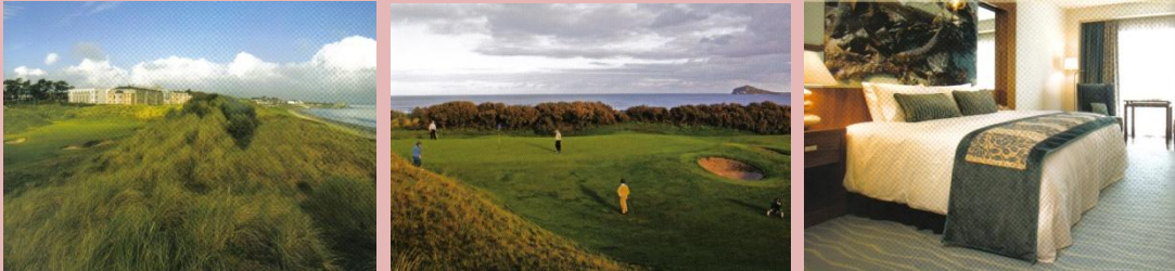
Portmarnock Hotel & Golf Links

Day 1 The Portmarnock Hotel is the former estate of the Jameson Whiskey family. Golf today is at the Portmarnock Links Championship golf course on site. Welcome Dinner.