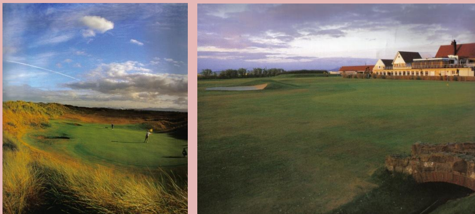
Portmarnock Old Course

Day 3 Thursday, August 30, 2012 Golf 18 Championship holes at the Portmarnock Old Course , home of many Irish Opens and amateur tournaments.