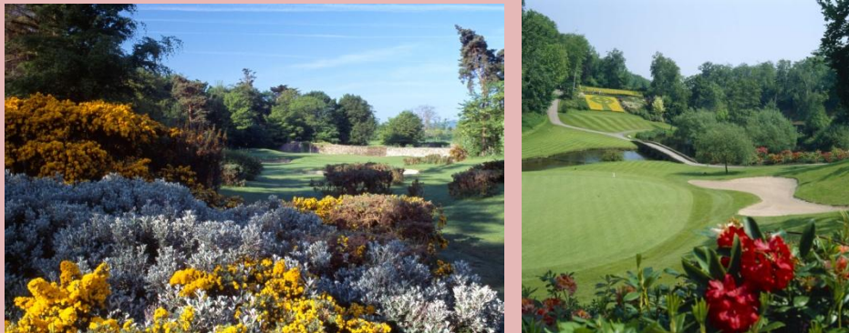
Druids Glen Golf Resort, Hotel & Spa

Day 4 Friday, August 31, 2012 Golf Royal Dublin golf course home to Irish great Christ O'Connor or 36 at Druids Glen Golf Resort .