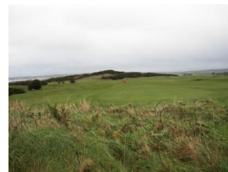
Port Stewart 8 th Hole