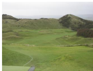
Port Stewart First Hole