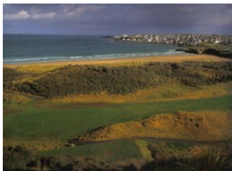
Port Stewart First Green

Day 6 Today your play is at the Port Stewart golf club. Test your skills on the Championship course known as The Strand. The club plays host to the Irish Amateur and qualifying for the Open. Port Stewart's first hole is said to be one of the toughest & best opening par 4 holes of golf courses around the world. Stay is at the Bayview hotel or Bushmills Inn.