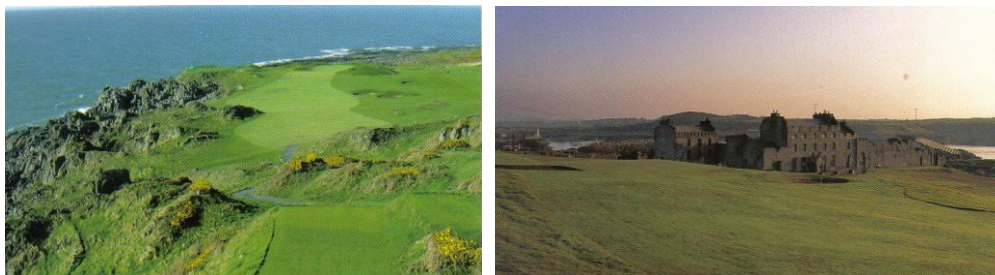
Ardglass Golf Club

Day 3 Motor coach to Ardglass golf club and play the scenic cliffside golf course. After golf our motor coach continues on to the towns of Portrush & Port Stewart for our stay at the Bushmills Inn, Bayview Hotel or the Magherbuoy Hotel.