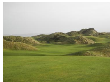
Castle Rock Golf Club