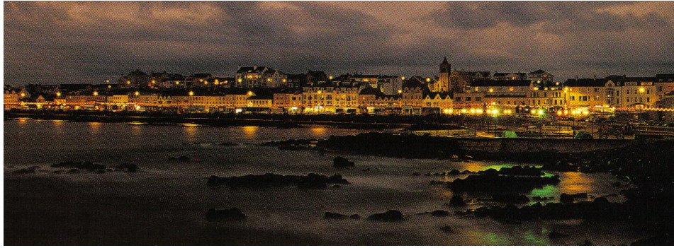
Town of Portrush, Northern, Ireland

Day 4 Play Royal Portrush GC , Dunluce Championship course. Home course of PGA and European Tour players Darren Clarke & Rory McElroy. On a clear day one can see Scotland from the 5 th hole. Portrush has great views of Atlantic Ocean and is former home to a British Open in 1951. England's Prince Andrew is a dedicated golfer and member of club.