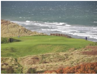
Royal Portrush GC

Day 4 Play Royal Portrush GC , Dunluce Championship course. Home course of PGA and European Tour players Darren Clarke & Rory McElroy. On a clear day one can see Scotland from the 5 th hole. Portrush has great views of Atlantic Ocean and is former home to a British Open in 1951. England's Prince Andrew is a dedicated golfer and member of club.