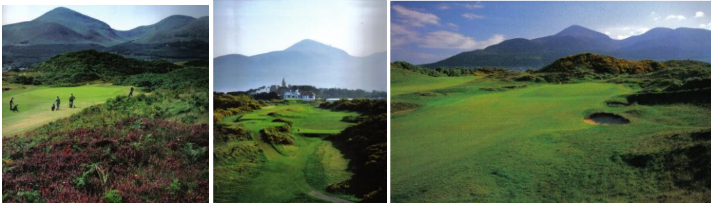
Royal County Down Golf Club

Day 2 In the morning you motor to Royal County Down golf club which some say is the number one rated golf course in the world. Stay is at the fabulous Slieve Donard Hotel just across the street.