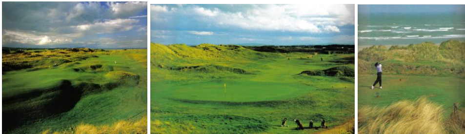
County Louth / Baltray

Day 1 Arrive Dublin 8:30 am and proceed via motor coach to County Louth and play the hidden gem known as Baltray a magnificent links course and home to the 2009 Irish Open . A favourite course of world wide stars Nick Faldo, Arnold Palmer along with two of Ireland’s best Des Smyth and Christy O’Conner. Your first night stay is in Drogheda at the Westcourt Hotel.